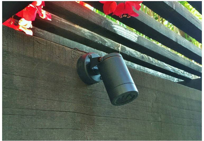
Shown with Dark Bronze finish

The E4 is an unobtrusive, low-voltage, directional fixture. Its minimalist design brings attention to the lamp's effect, not to the fixture itself. The E4 takes advantage of LED modules that can produce 10°-120° beam spreads with just a simple change of our line of field-serviceable optics.