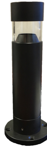
MB4-9 shown in Black finish with JB Cover. Does not show required shield.

The MB4 is a contemporary brass bollard ideal for higher-traffic applications as an alternative to path light fixtures with shades.