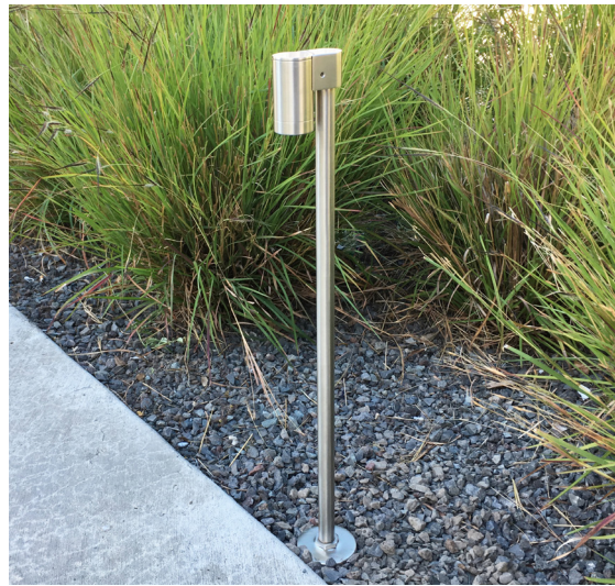
Shown with Nickel Finish

Finish: Unfinished is standard; no specification required. The fixture will weather to a natural patina. The patina process is natural with brass and copper. Rate of patina and eventual color is dependent upon climate and proximity to the ocean. Thus, Beachside does not guarantee any specific appearance.