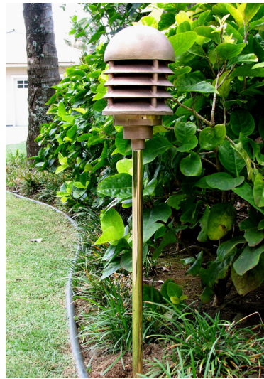
Multi-louver for Halogen, Metal Halide, Xenon, and LED lamps

The M-Series pathlights are the ultimate in heavy duty landscape lighting. Made of cast brass, these fixtures are larger than other Beachside pathlight fixtures. The multi-louver design uses incandescent, metal halide, xenon, and omnidirectional LED lamps. The single-louver design uses MR16 LEDs.