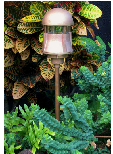
Single-louver for MR16 LED lamps

Construction Cast brass shade, louvers, and base assembly. 1/2" schedule 40 brass stem.