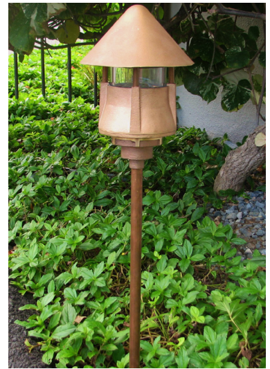
Single-louver for MR16 LED lamps

Construction Cast brass shade, louvers, and base assembly. 1/2" schedule 40 brass stem.