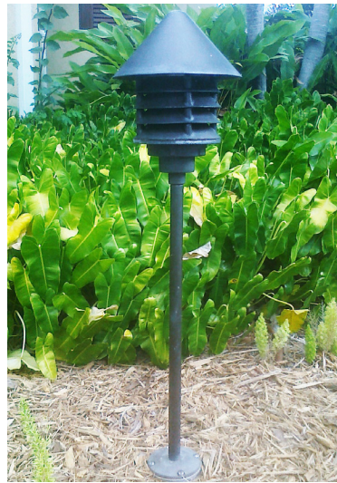
Multi-louver for Halogen, Metal Halide, Xenon, and LED lamps

The M-Series pathlights are the ultimate in heavy duty landscape lighting. Made of cast brass, these fixtures are larger than other Beachside pathlight fixtures. The multi-louver design uses incandescent, metal halide, xenon, and omnidirectional LED lamps. The single-louver design uses MR16 LEDs.