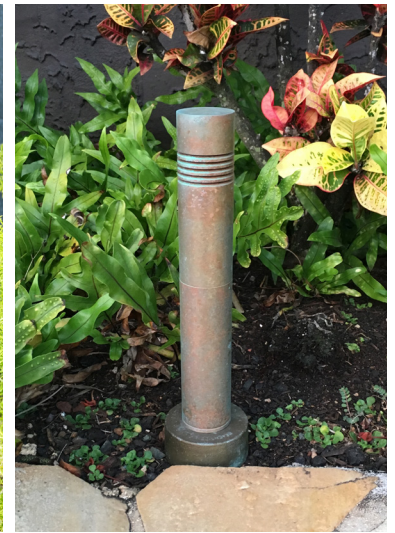
Shown in unfinished brass

Construction All brass components. 1.6" diameter x 0.125" wall (41 mm x 3.2 mm) brass cylindrical housing.