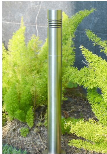
Shown with nickel finish

The MB1 is an unobtrusive, contemporary pathlight/bollard hybrid. It features 180° illumination via the field-rotatable top assembly. Its 1/2" male thread allows mounting onto a heavy-duty ground spike or brass junction box that can be recessed in concrete. The MB1 can also have a stem added to its 6" high top for greater mounting heights and a telescoping option (illustration on right).