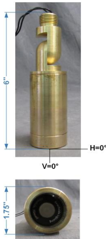
FIG. 1 LUMINAIRE