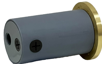
PVC Housing and Concrete Ring shown on E9-R-CR