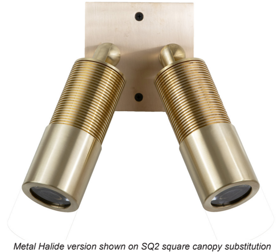
Metal Halide version shown on SQ2 square canopy substitution

Finish: Unfinished is standard; no specification required. The fixture will weather to a natural patina. The patina process is natural with brass and copper. Rate of patina and eventual color is dependent upon climate and proximity to the ocean. Thus, Beachside does not guarantee any specific appearance.