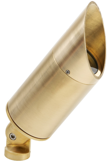
L-011 with BGS Accessory