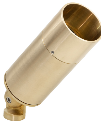
L-011 with BGSF Accessory