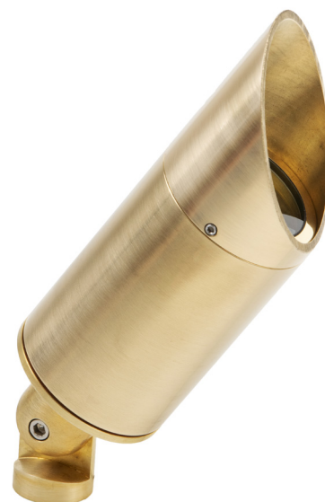
L-011 with BGS Accessory