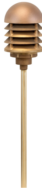
Multi-louver for Omnidirectional LED lamps