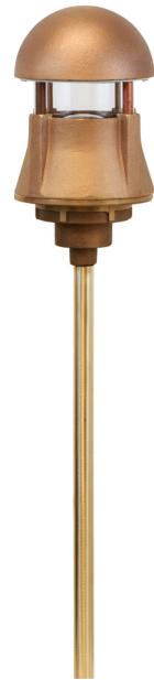
Single-louver for light engines and MR16 LED lamps