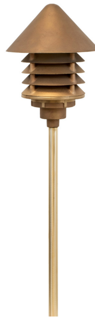
Multi-louver for Omnidirectional LED lamps