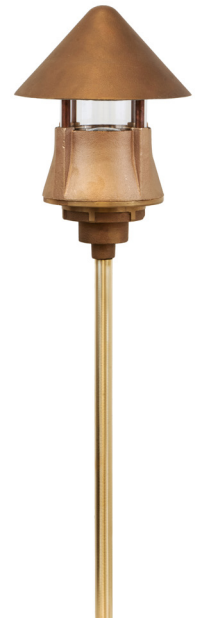
Single-louver for light engines and MR16 LED lamps