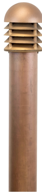
Multi-louver for Omnidirectional LED lamps