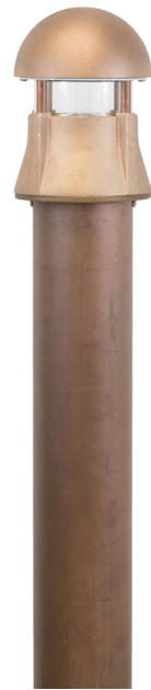
Single-louver for LED light engines and MR16 LED lamps