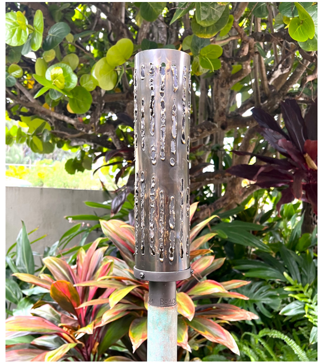
Shown with bronze acid finish

10 year fixture warranty 3 year warranty on MR11 LED lamps