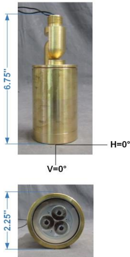
FIG. 1 LUMINAIRE